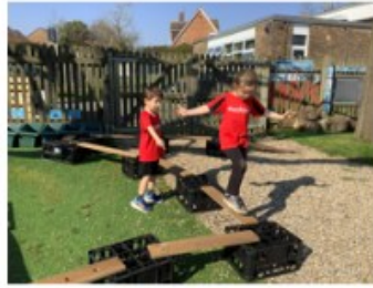
together the children built an obstacle course and were giving each other directions