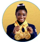
Simone Biles, Olympian Gymnast