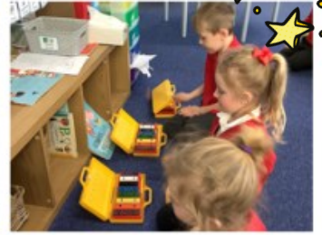
we have been playing instruments in music