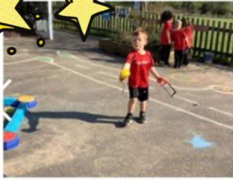
Hand eye coordination skills