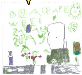
Marlee - Cherry Class