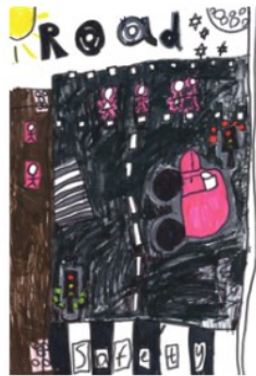
Phoebe - Maple Class