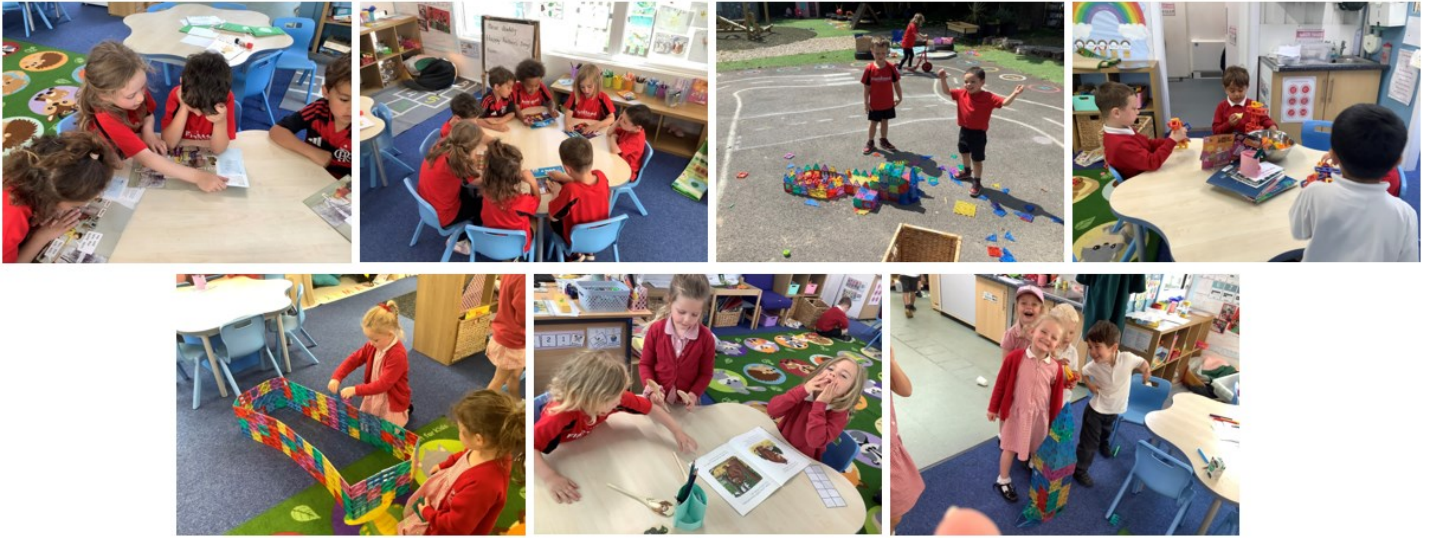
Outdoor Maths in Maple!

Cherry Class enjoying lots of learning this week.