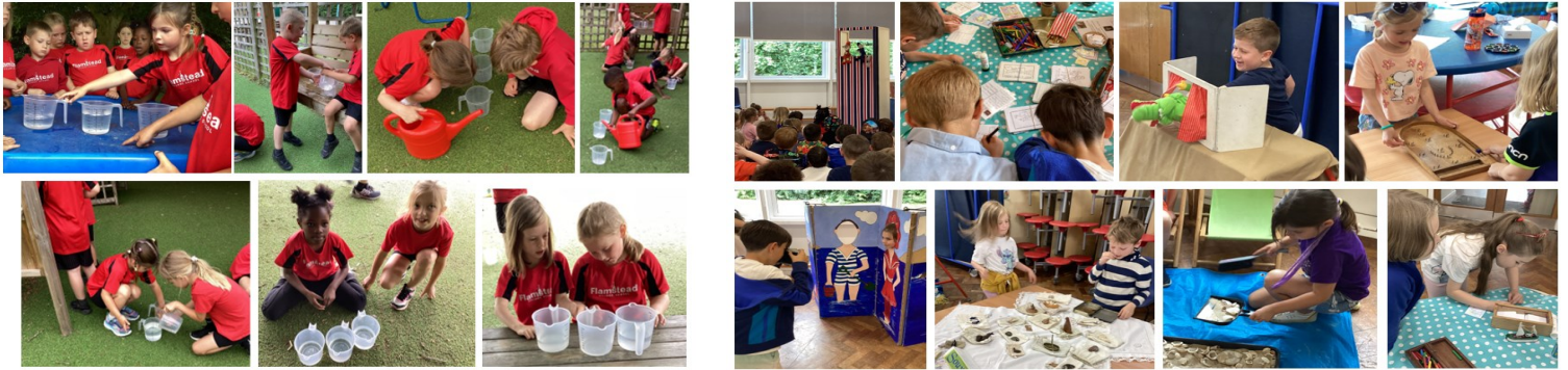
Maple Class enjoying their seaside workshop