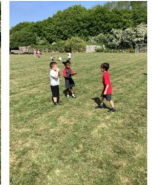
Fire Service Visit