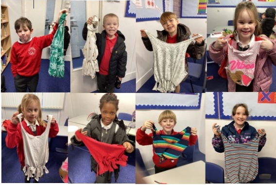
Eco Club made a bag each using recycled old t-shirts.