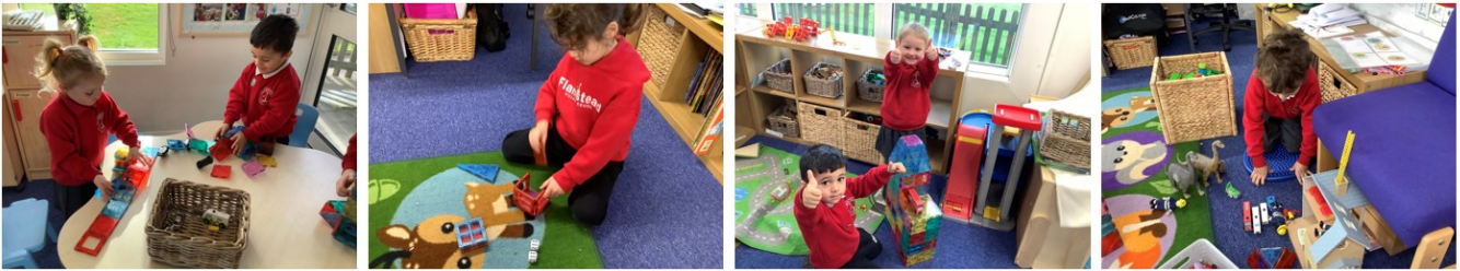
Lego Club – National Penguin Day