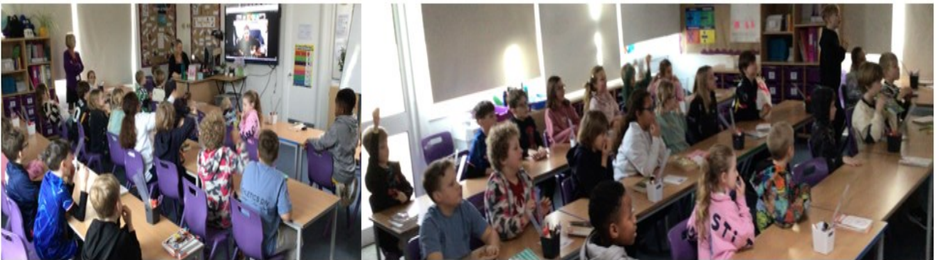
Enjoying the Electric Umbrella Workshop