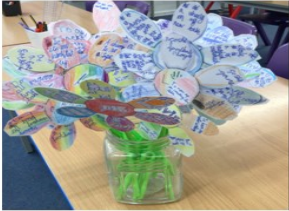
Flowerpot of dreams