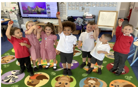
Maple class enjoying their activities and just look at the juicy tomatoes Reception picked from our outdoor area!