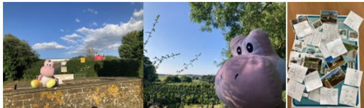
Blue Unicorn Winners